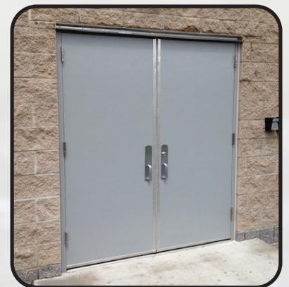
Shown in Haze Gray