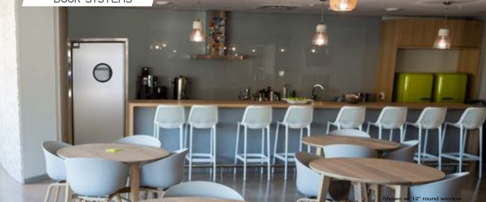
Shown w/ 12" round window

Patent Pending Lightweight Aluminum Traffic Door