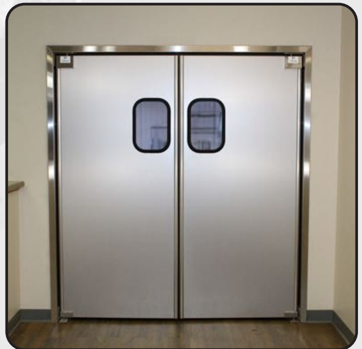
Shown w/ standard 9" x 14" windows